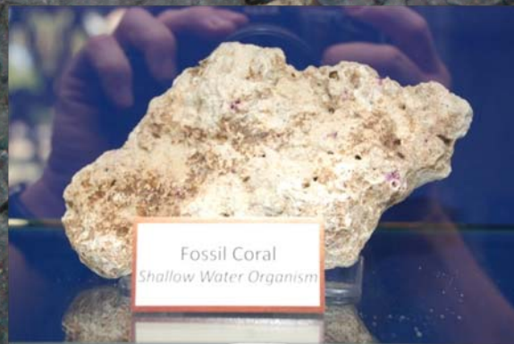
Fossil Coral Shallow Water Organism