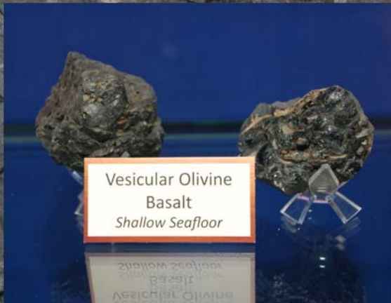
Vesicular Olivine Basalt Shallow Seafloor