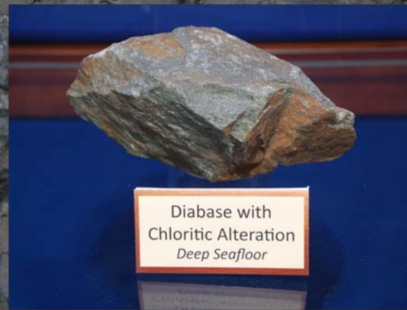
Diabase with Chloritic Alteration Deep Seafloor