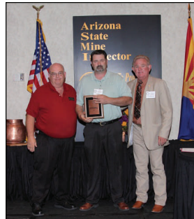
Black Angus Plant