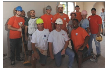
East Valley Mustangs Semi Pro Football Team