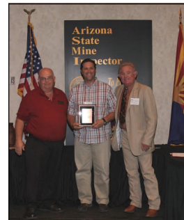
Sun City Plant