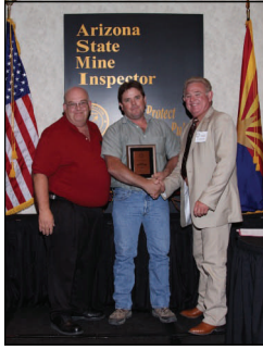
ABC Sand & Rock: Accident Free Award