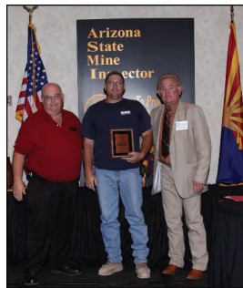
Val Vist Plant