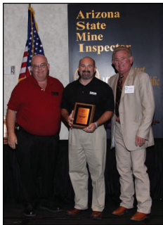
West 43rd Plant