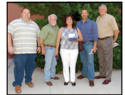
Salt River Materials Group