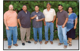
Gila River Sand and Gravel