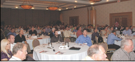
Critical Issues Conference